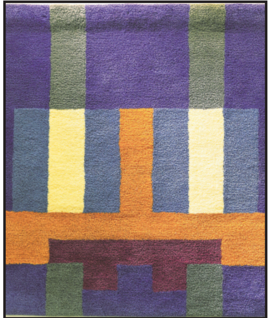
Untitled by Herbert Bayer, N.D.