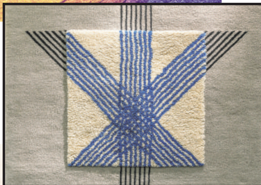
ABOVE: Close detail of Chromatic Composition by Herbert Bayer, 1976. RIGHT: Jason tapestry by Herbert Bayer, 1961 BELOW: Chromatic Gates series by Herbert Bayer, 1970.