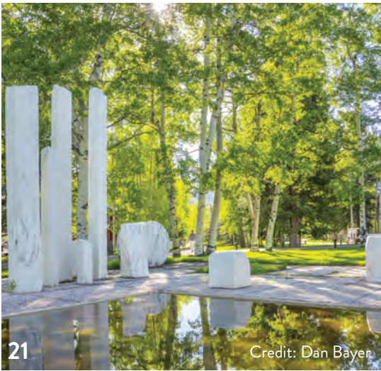
21 Credit: Dan Bayer